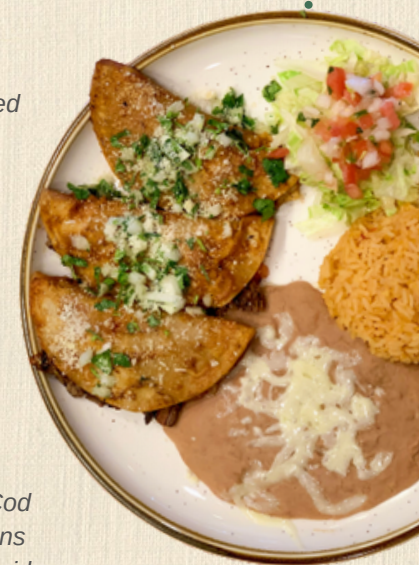
TACOS AL CARBÓN