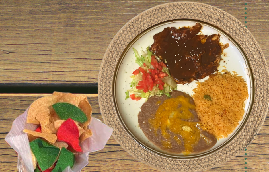
MOLE CON POLLO