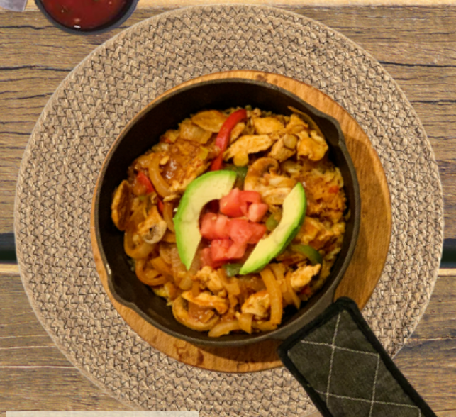
ARROZ CON POLLO